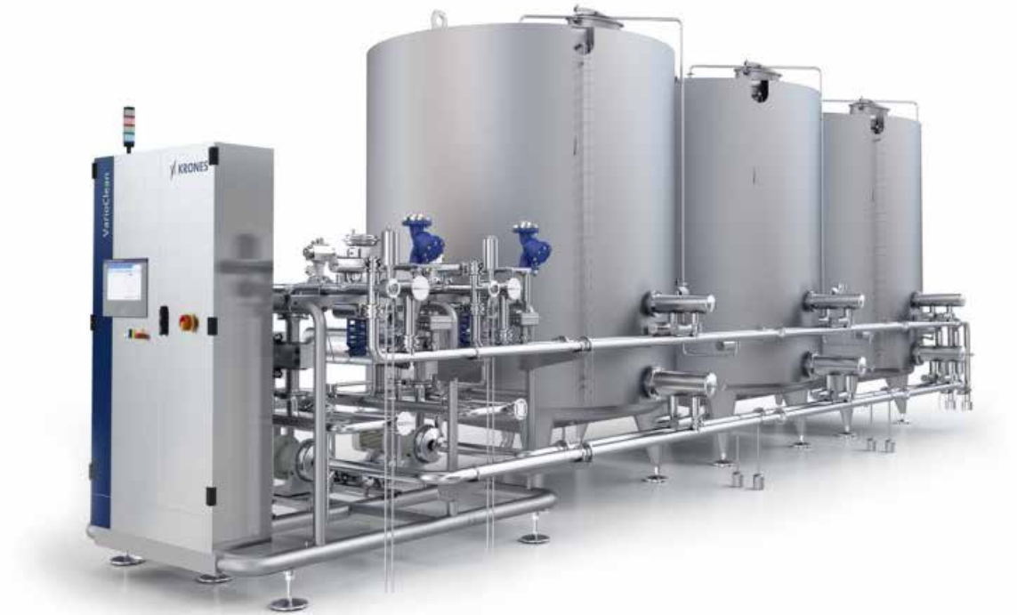
VarioClean with two CIP routes