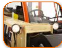
Boom Work Lights