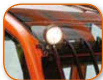
Cabin Work Lights