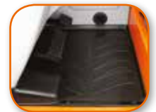
Non Slip Floor Mat