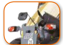
Rear Road Lights