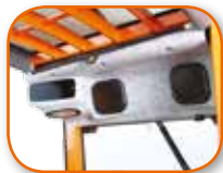
Radio Ready Kit