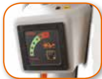
Load Stability Indicator