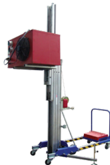
Optional Fork Attachment 560mm (w) x 700mm (l)

Note: Weights must be secured before lifting