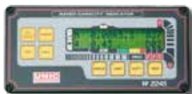
Full safe load indicator