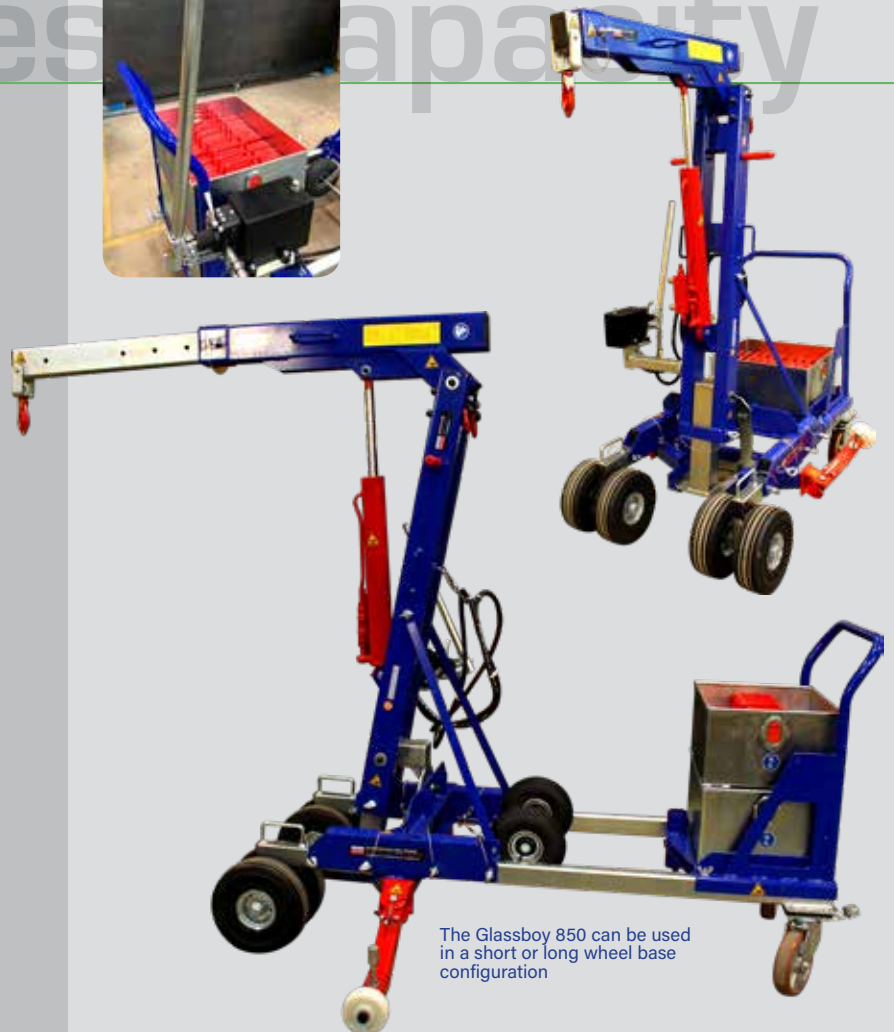
The Glassboy 850 can be used in a short or long wheel base configuration