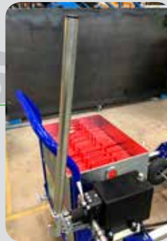
Features include a moveable hand pump.