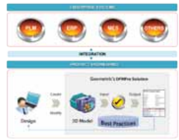
Integrates easily with existing enterprise infrastructure

Scalable framework for capturing and disseminating manufacturing knowledge upstream