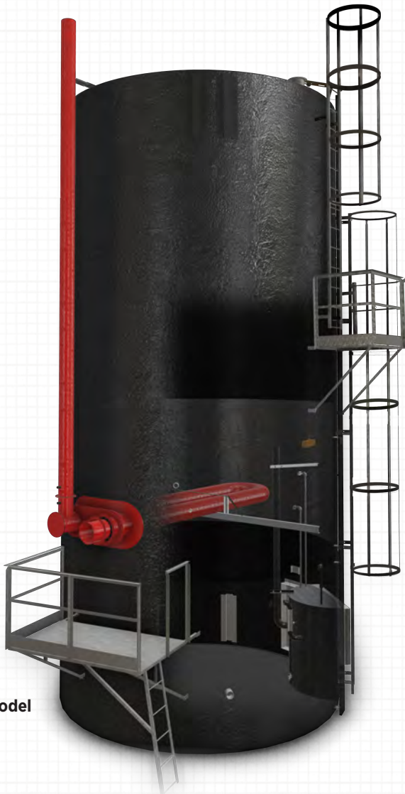
FS-1001 Model 1,000 BBL