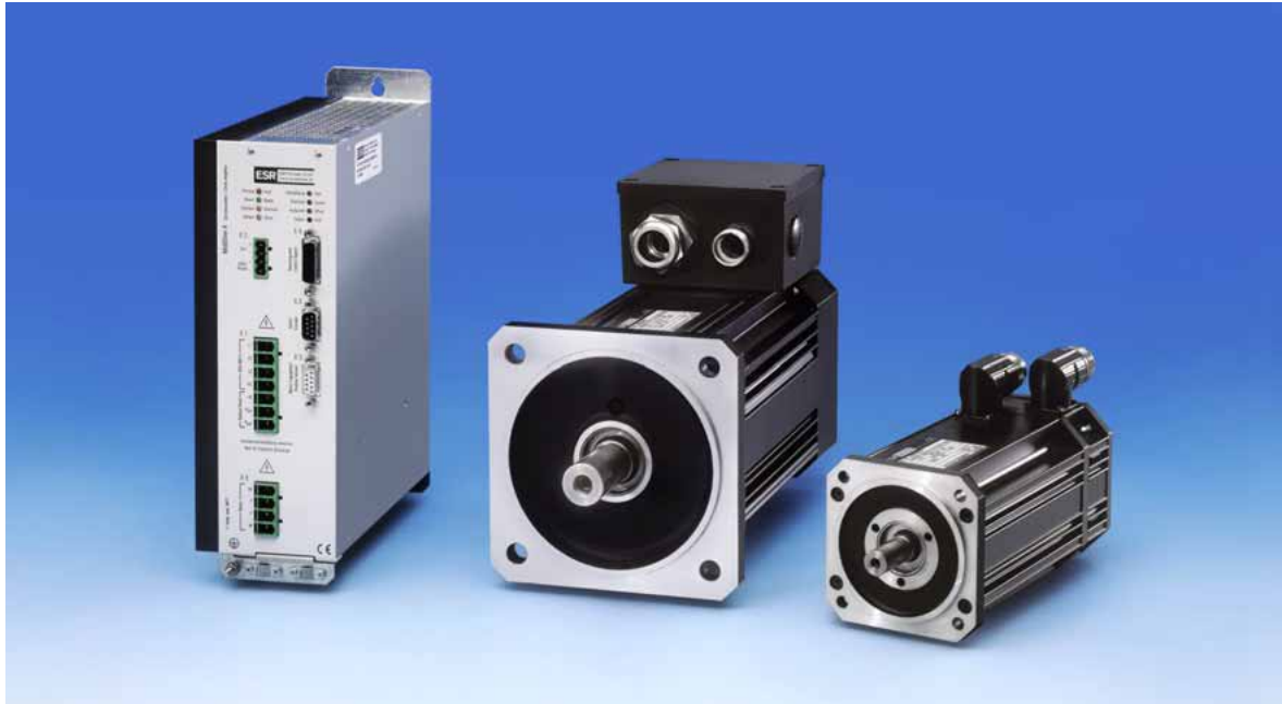
Components of the MidiDrive A servo drive family: BN 6682 servo drive (4 A, U_{DC} = 560 V), MR 7434 (4.0 Nm at 6000 \text{ min}^{-1} ) and MR 4106 (0.65 Nm at 6000 \text{ min}^{-1} ) motors

Analog AC servo drive systems with sinusoidal commutation Servo drives in compact design, 3 × 400/480 V mains connection Servo motors with high power density up to 48 Nm / 10 kW