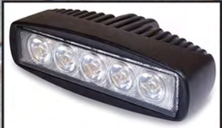
Optional LED Work Light Kit