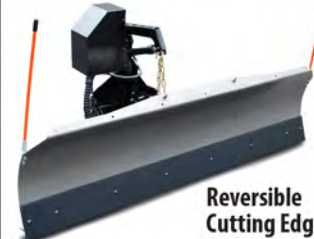
Reversible Cutting Edge