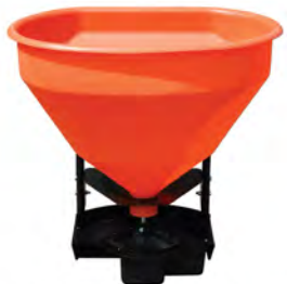
FAST CAST 300 MATERIAL SPREADER