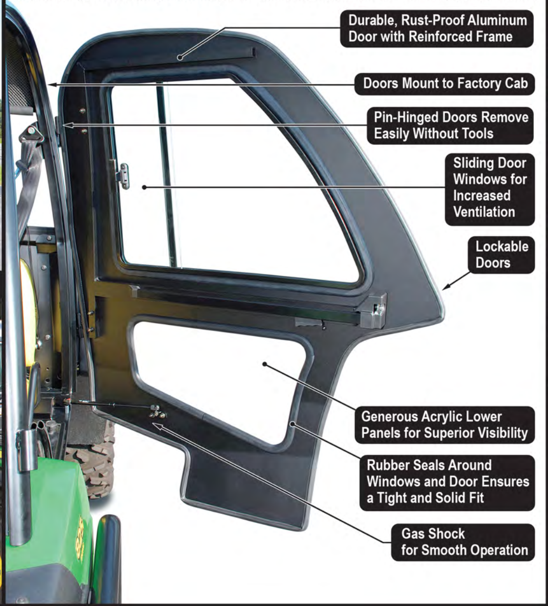
Fits 2004 and Newer 620i, 625i, 825i, 850D and 855D Gators with a #4004 Deluxe Cab Frame.