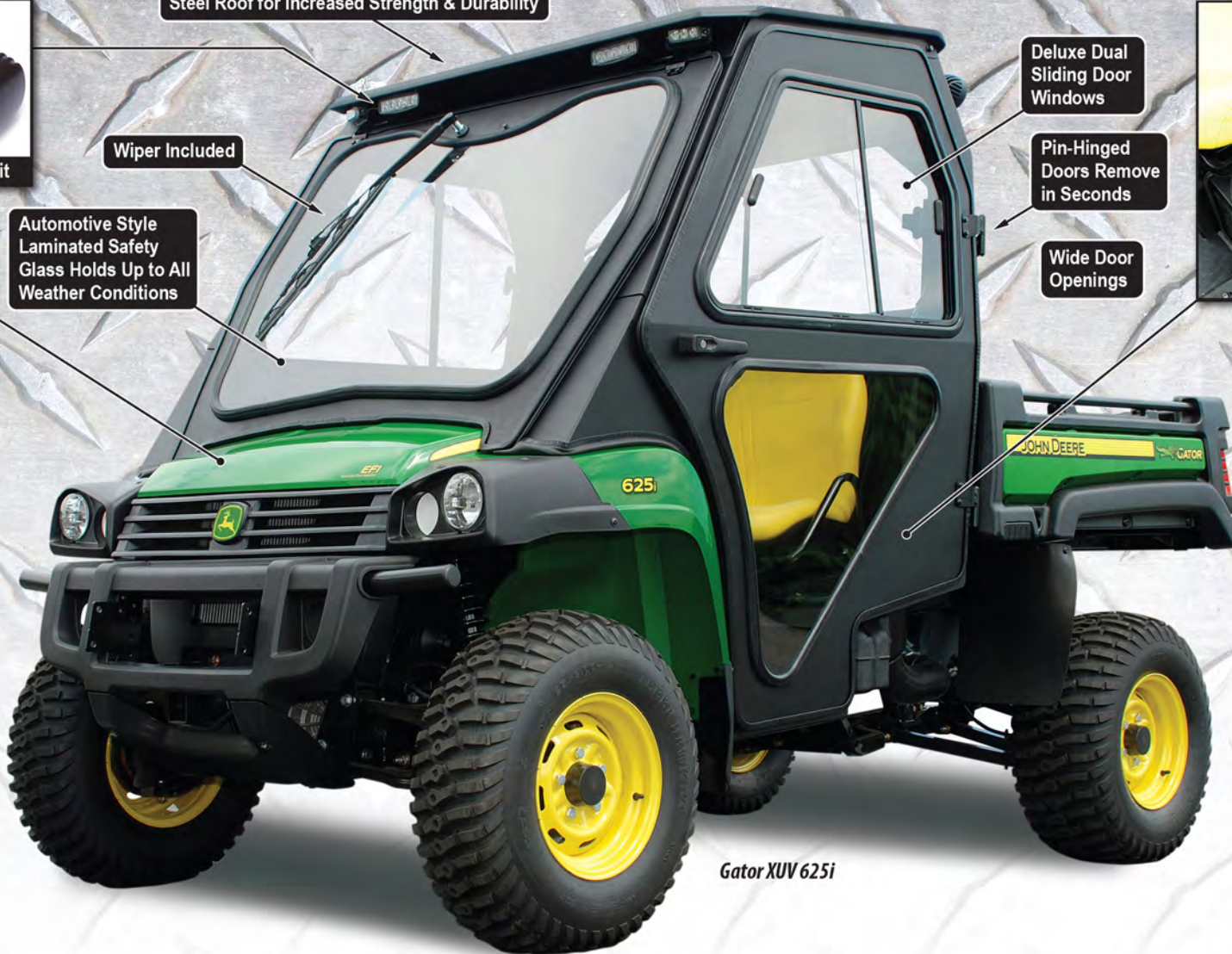
Gator XUV 625i

See Genuine Curtis Accessories for your Utility Vehicle on Page 15