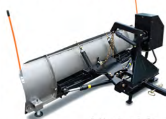
Rubber Snow Deflector and Rubber Cutting Edge Available