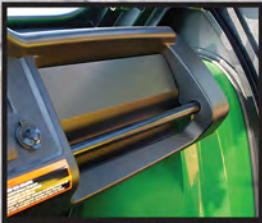
Non-Intrusive Cab Heater