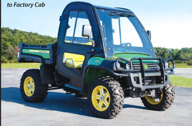
Doors Mount to Factory Cab