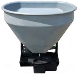
FAST CAST 400 FINE MATERIALS SPREADER