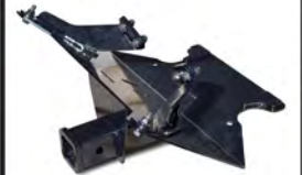
No Drilling on Mount Kits Faster Installation Time