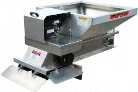
FAST CAST 550 SPREADER - GAS OR ELECTRIC