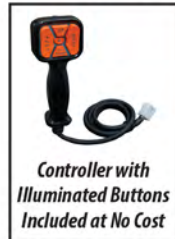
Controller with Illuminated Buttons Included at No Cost