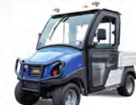
Club Car Carryall