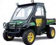
John Deere Gator XUV