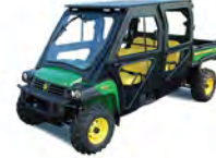
John Deere Gator 4