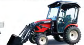
Yanmar 424 All Glass