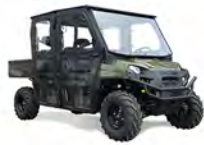
Polaris Ranger Crew