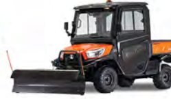
Kubota RTV X900