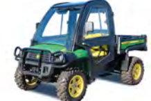
Gator Aluminum Doors