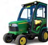
John Deere X700