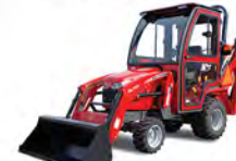
Massey Ferguson GC1700