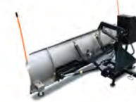
Commercial UTV Plow