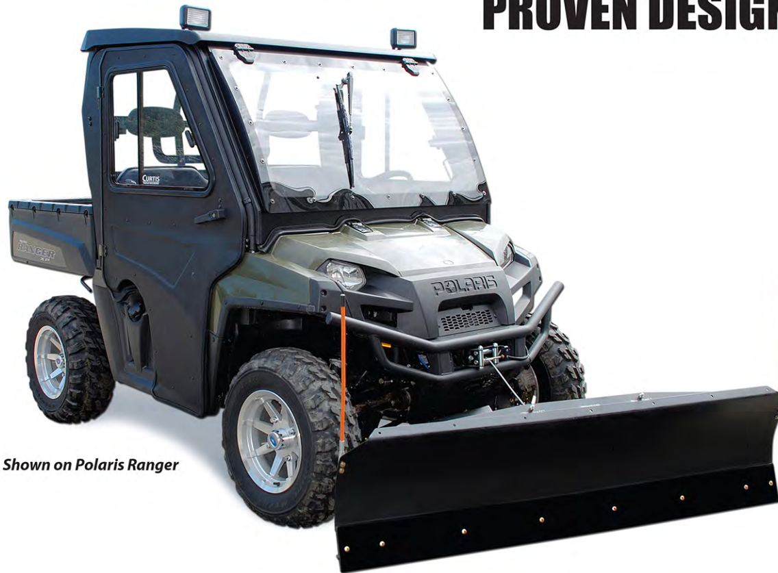
Shown on Polaris Ranger