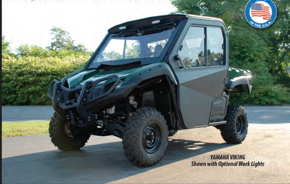
YAMAHA VIKING Shown with Optional Work Lights