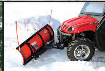
Curtis Cabs and Plows for Rhino Call A Curtis Dealer for Details