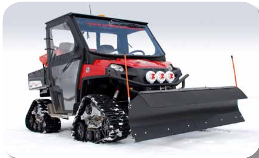
PathPro SS cab system for 2010 Polaris Ranger 800*