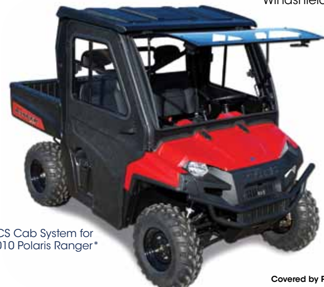
RCS Cab System for 2010 Polaris Ranger*

Hard Coat Polycarbonate Windshield (shown)