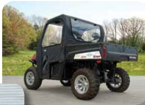
PathPro cab system for 2010 Polaris Ranger*