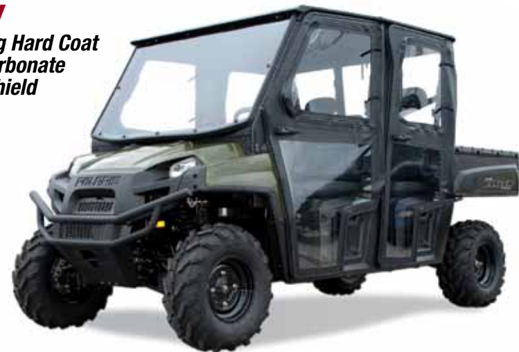
PathPro SS cab system for 2010 Polaris Ranger 800 Crew*

NEW Venting Hard Coat Polycarbonate Windshield