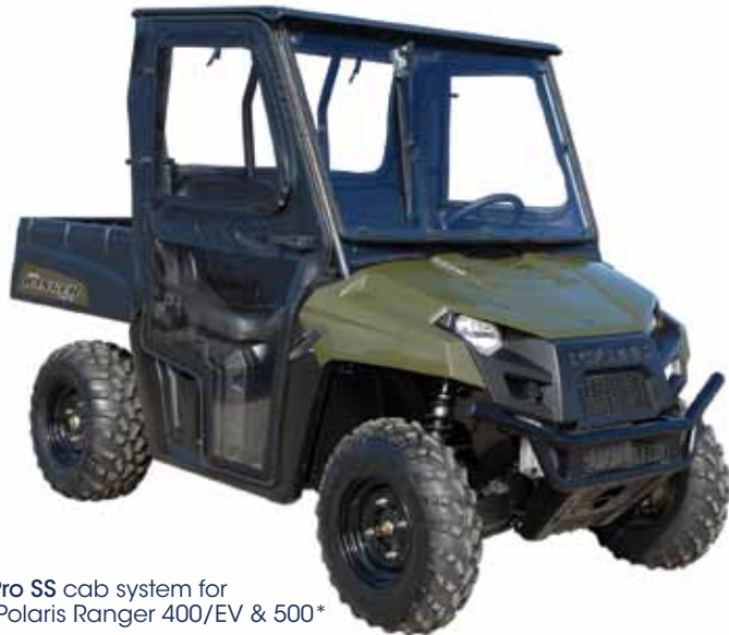
PathPro SS cab system for 2010 Polaris Ranger 400/EV & 500*