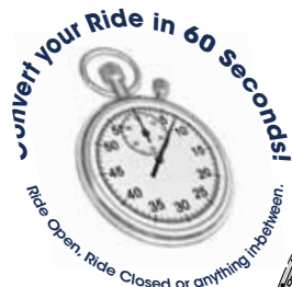
RCS Cab System for 2009 Polaris Ranger*