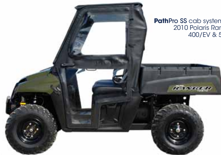
PathPro SS cab system for 2010 Polaris Ranger 400/EV & 500*