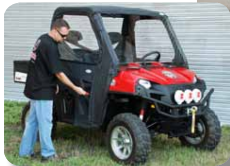
PathPro cab system for 2010 Polaris Ranger*