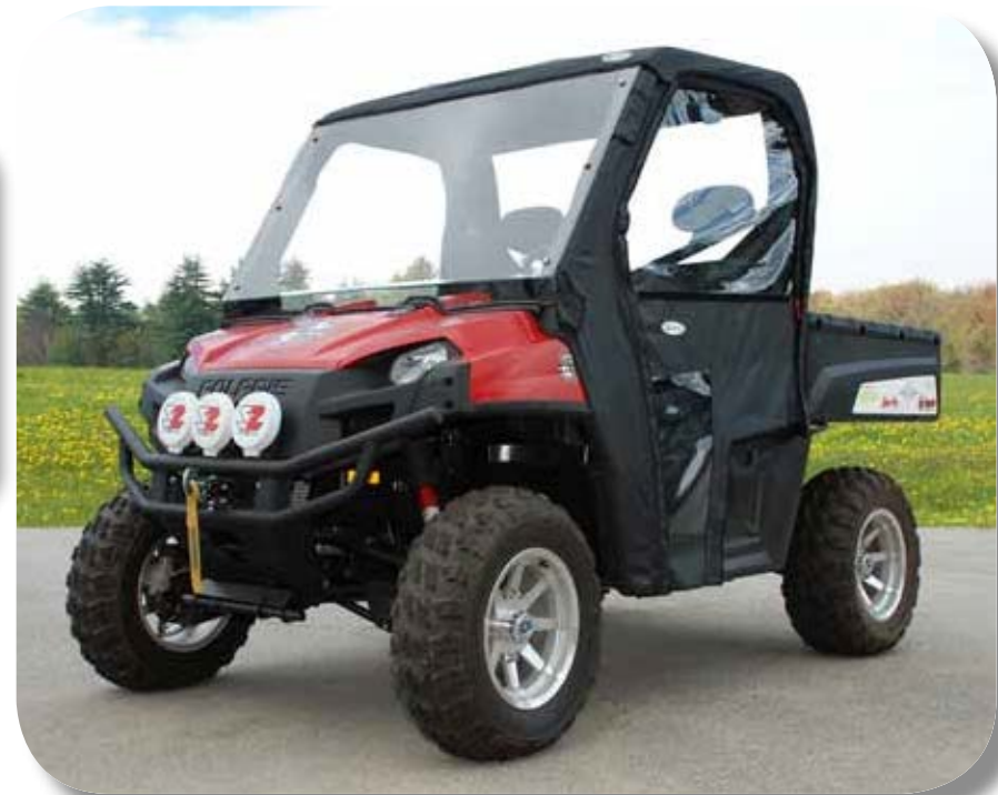
PathPro cab system for 2010 Polaris Ranger*