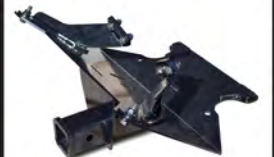
No Drilling on Mount Kits Faster Installation Time