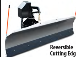
Reversible Cutting Edge