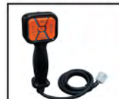
Controller with Illuminated Buttons Included at No Cost