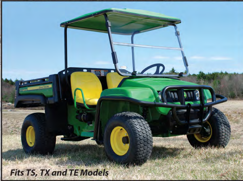
Fits TS, TX and TE Models