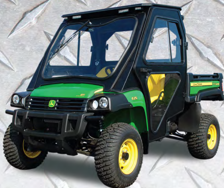
Gator XUV 625i