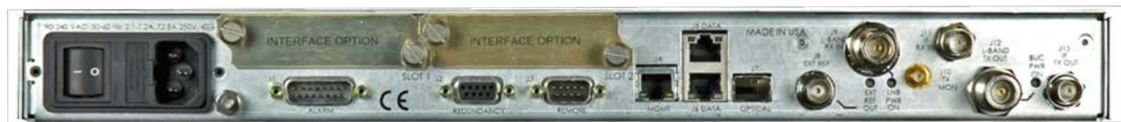
CDM-750 Rear Panel