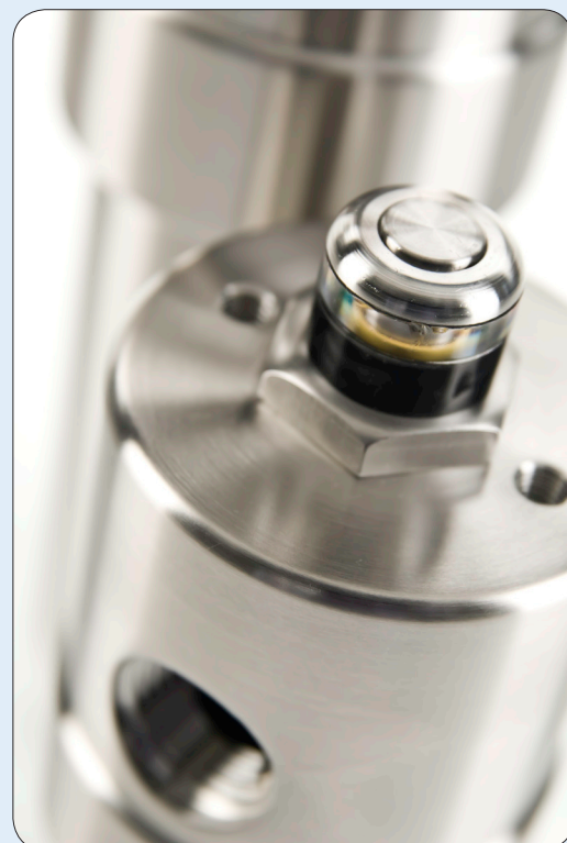
The SiS series housings feature a visual indicator