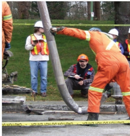
A SAMPLE BEING EXTRUDED INTO PLASTIC CORE BAG