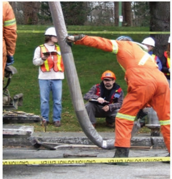
A SAMPLE BEING EXTRUDED INTO PLASTIC CORE BAG