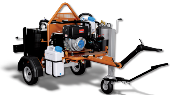
MAUS type 90B / 36-00 without dust cover Order number: 36 00 00 00 (HATZ-gasoil engine) Order number: 36 00 00 ES (HATZ-gasoil engine, E-start)