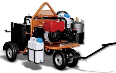
MAUS type 90B / 30-00 without dust cover Order number: 30 00 00 00 (HONDA-petrol engine)

Pump drive over 3,1 KW HATZ-gasoil engine