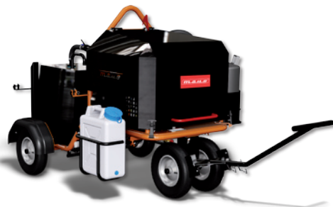
MAUS type 90B / 32-00 with dust cover Order number: 32 00 00 00 (HONDA-petrol engine)