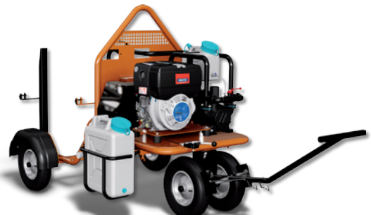
MAUS type 90A / 25-00 without dust cover Order number: 25 00 00 00 (HATZ-gasoil engine) Order number: 25 00 00 ES (HATZ-gasoil engine, E-start)