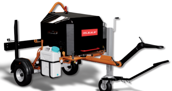
MAUS type 90A / 28-00 with dust cover Order number: 28 00 00 00 (HATZ-gasoil engine) Order number: 28 00 00 ES (HATZ-gasoil engine, E-start)