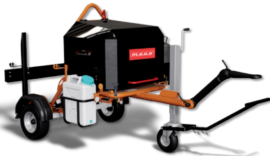
MAUS type 90A / 23-00 with dust cover Order number: 23 00 00 00 (HONDA-petrol engine)