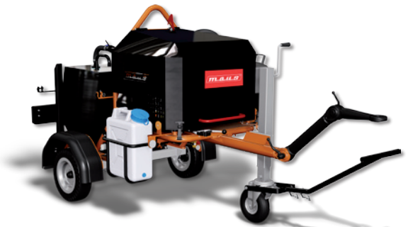
MAUS type 90B / 38-00 with dust cover Order number: 38 00 00 00 (HATZ-gasoil engine) Order number: 38 00 00 ES (HATZ-gasoil engine, E-start)