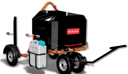
MAUS type 90A / 27-00 with dust cover Order number: 27 00 00 00 (HATZ-gasoil engine) Order number: 27 00 00 ES (HATZ-gasoil engine, E-start)