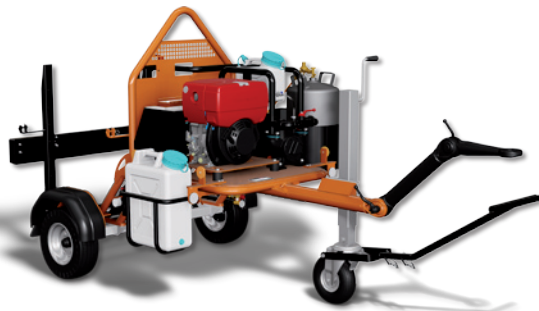
MAUS type 90A / 21-00 without dust cover Order number: 21 00 00 00 (HONDA-petrol engine)

Pump drive over 3,1 KW HATZ-gasoil engine