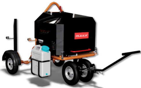
MAUS type 90A / 22-00 with dust cover Order number: 22 00 00 00 (HONDA-petrol engine)