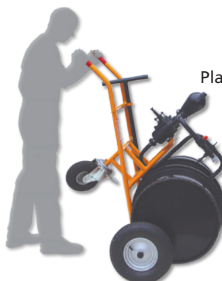
Playing light barrel accommodation.

MAUS type 89 / 11-00 Order number.: 11 00 00 00 accessories on page 18