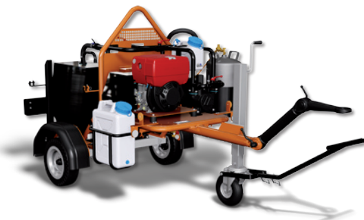
MAUS type 90B / 31-00 without dust cover Order number: 31 00 00 00 (HONDA-petrol engine)

Pump drive over 3,1 KW HATZ-gasoil engine