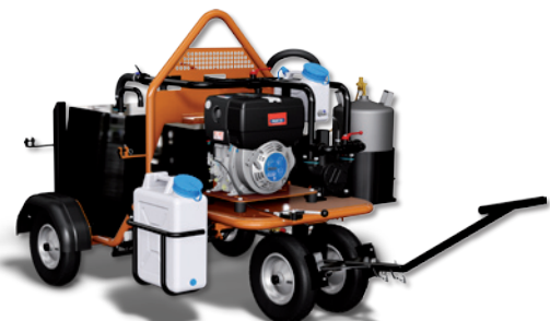
MAUS type 90B / 35-00 without dust cover Order number: 35 00 00 00 (HATZ-gasoil engine) Order number: 35 00 00 ES (HATZ-gasoil engine, E-start)