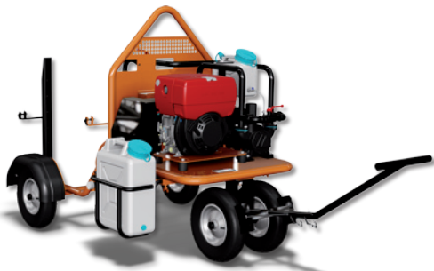
MAUS type 90A / 20-00 without dust cover Order number: 20 00 00 00 (HONDA-petrol engine)

Pump drive over 3,1 KW HATZ-gasoil engine