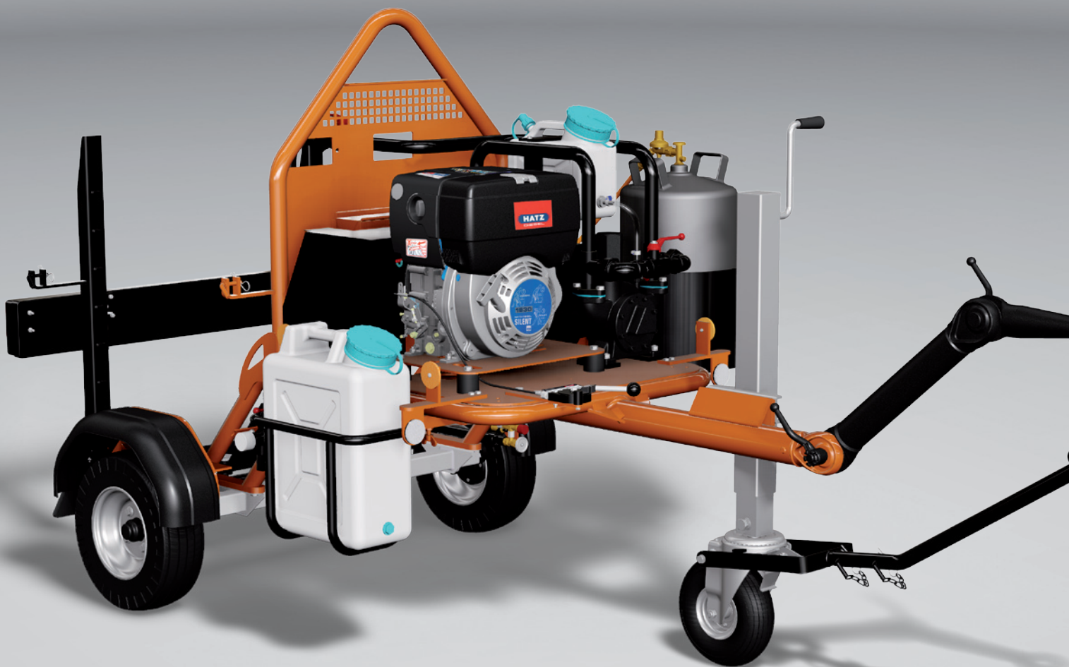
Figure indicates MAUS type 90A / 26-00 with barrel heating