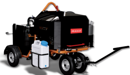
MAUS type 90B / 37-00 with dust cover Order number: 37 00 00 00 (HATZ-gasoil engine) Order number: 37 00 00 ES (HATZ-gasoil engine, E-start)