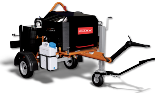
MAUS type 90B / 33-00 with dust cover Order number: 33 00 00 00 (HONDA-petrol engine)