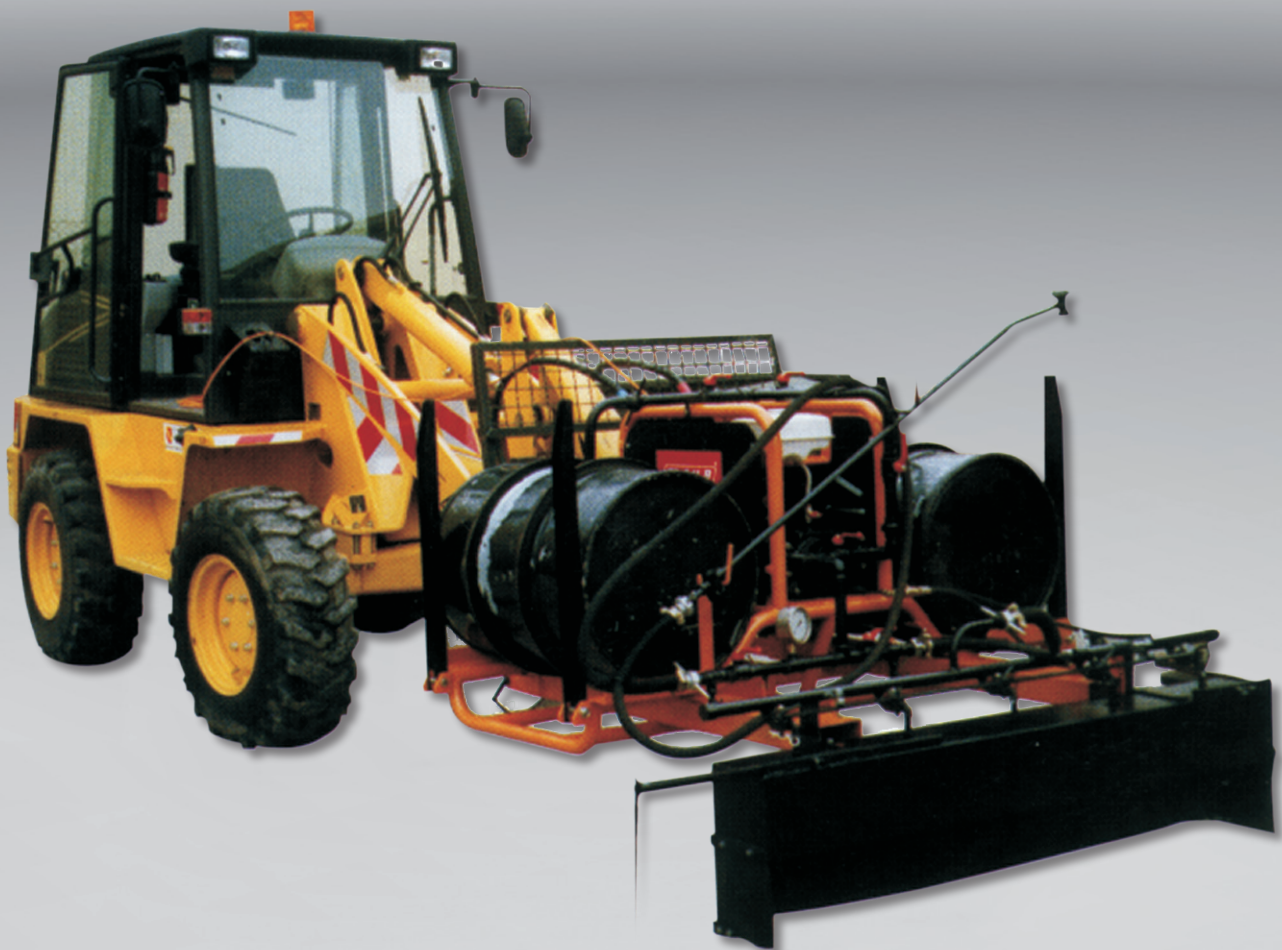
Figure indicates MAUS type 85 / 85-00 without barrel heating

* if necessary in connection with barrel heating (accessories on page 19)