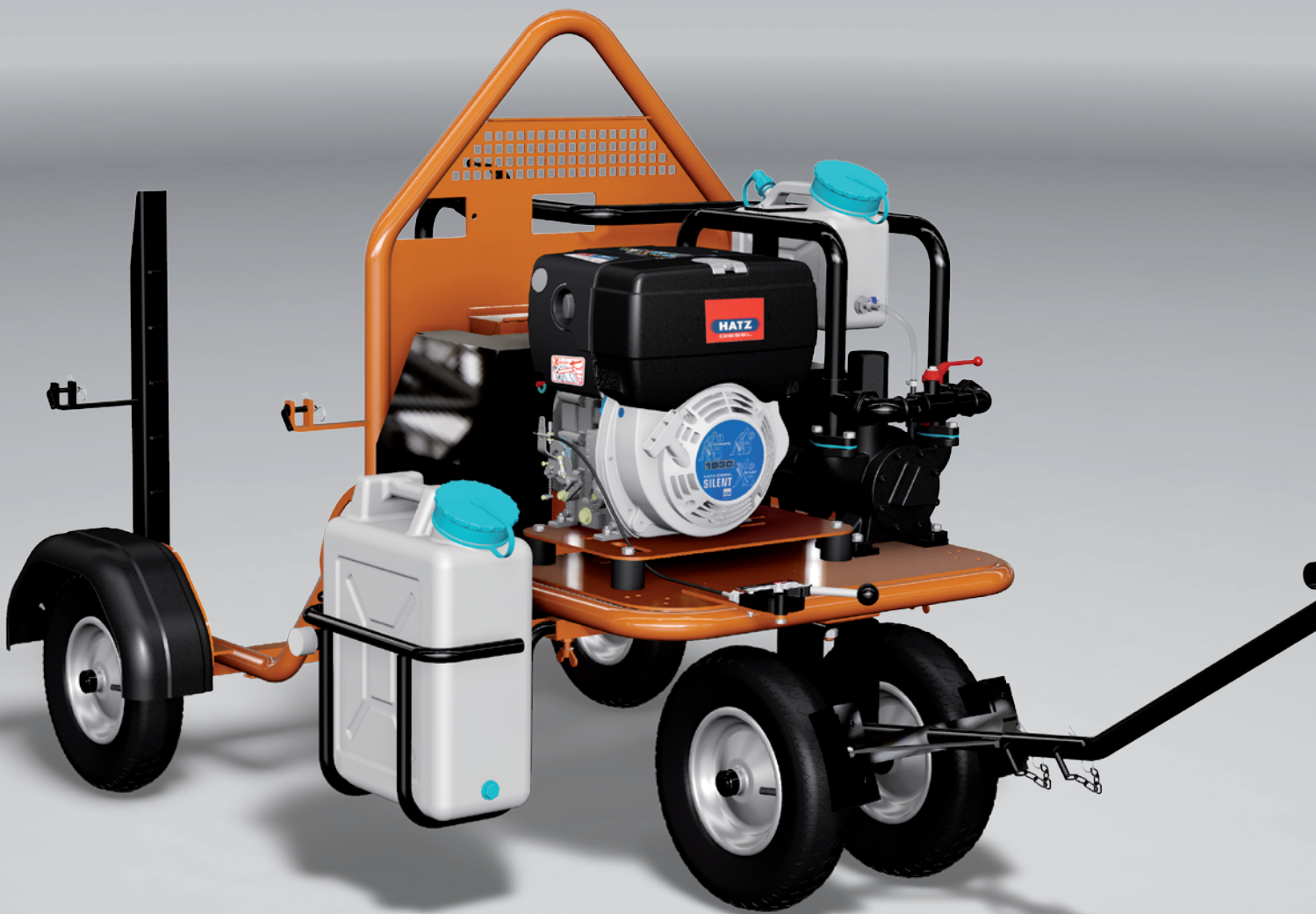
Figure indicates MAUS type 90A / 25-00 without barrel heating

* if necessary in connection with barrel heating (accessories on page 19)