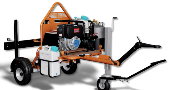
MAUS type 90A / 26-00 without dust cover Order number: 26 00 00 00 (HATZ-gasoil engine) Order number: 26 00 00 ES (HATZ-gasoil engine, E-start)