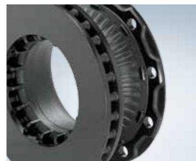
Original brake disc from BPW: high wear and crack resistance ensured.