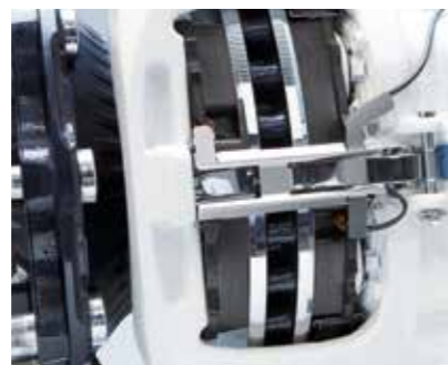
Wear sensor (optional): reliable technology that punctually detects when the wear limit of the brake linings has been reached.