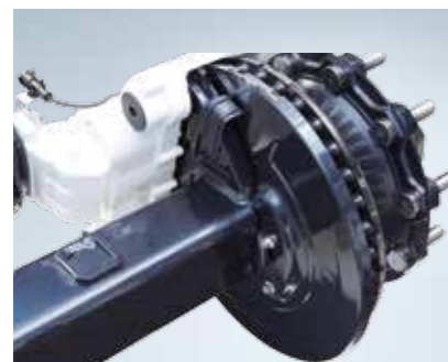
Disc Protector (optional): additional protection for trailer disc brakes in tough applications.