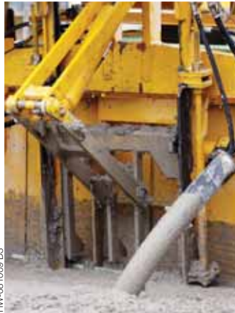
The inserter is activated at a specific location and releases the bar into the concrete.