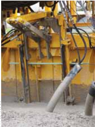
A single bar is loaded and waits as the paver travels to the next insertion point.

The GOMACO Paver Accessory Display is managing two 5400 series bar inserters and two PTAs on this GOMACO GP-4000 two-track paver.