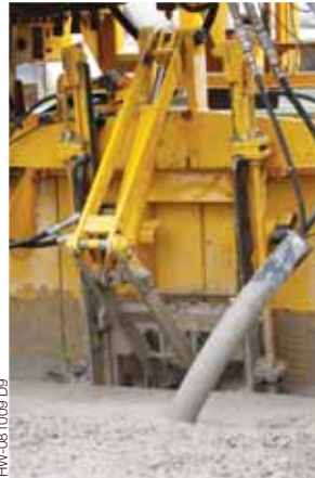
The bar inserter accurately pushes the bar into proper position and alignment.