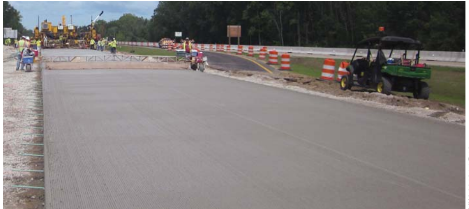
U.S. Highway 10 in Clare, Michigan, USA, received a six inch (152 mm) whitotopping using a GOMACO GHP-2800 paver with IDBI and Trimble 3D stringless controls.