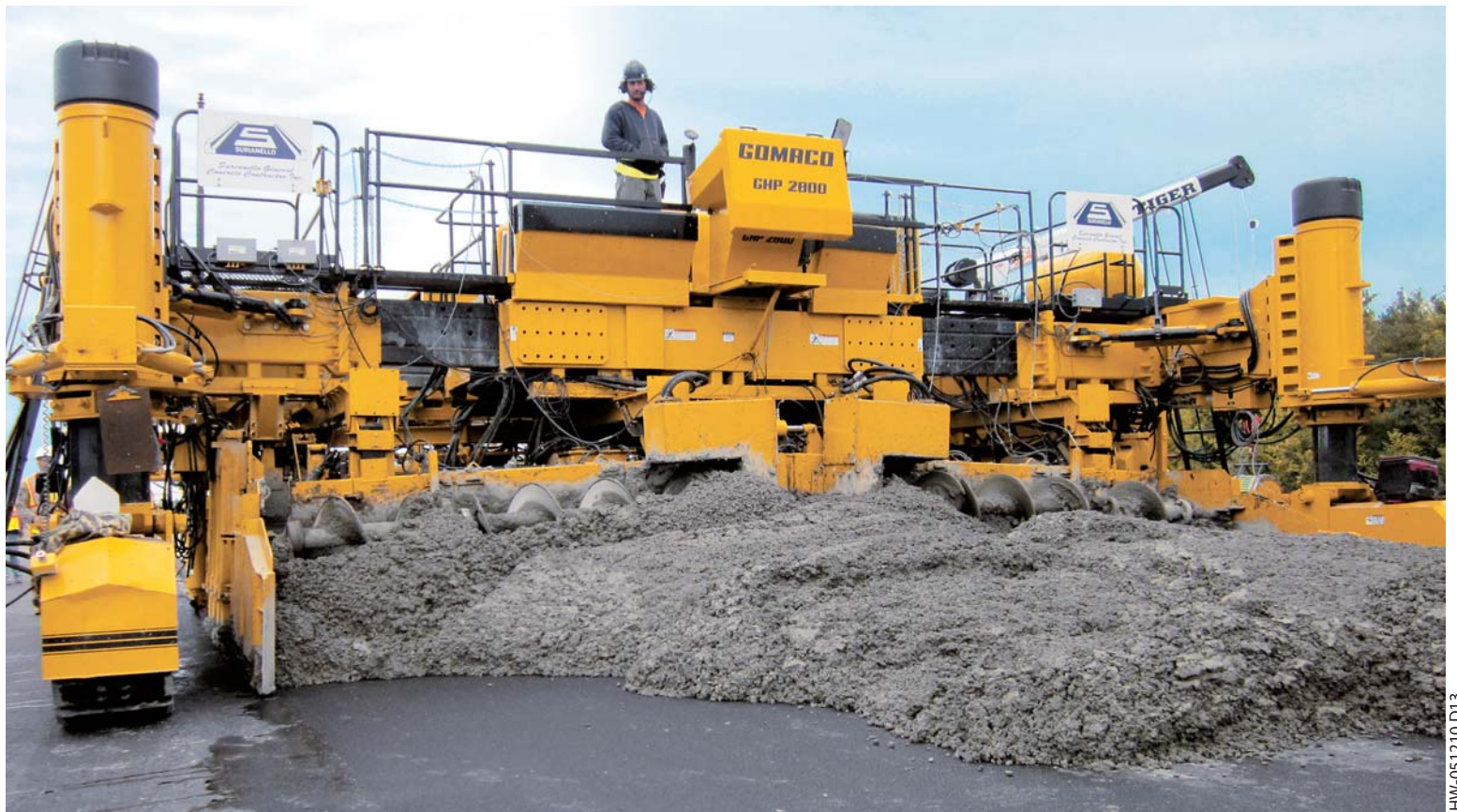
A GOMACO GHP-2800 is slipforming the new concrete overlay on top of existing asphalt.