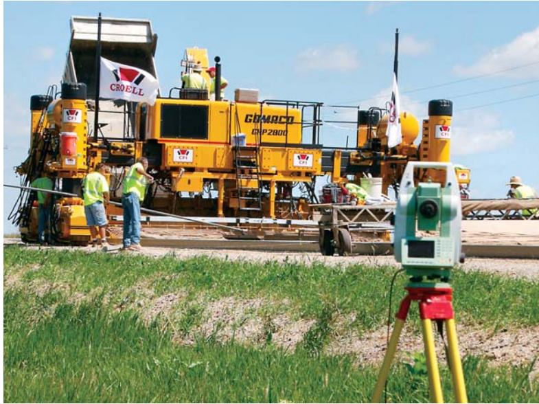
Four Leica Geosystems total stations are at work on the stringless project.