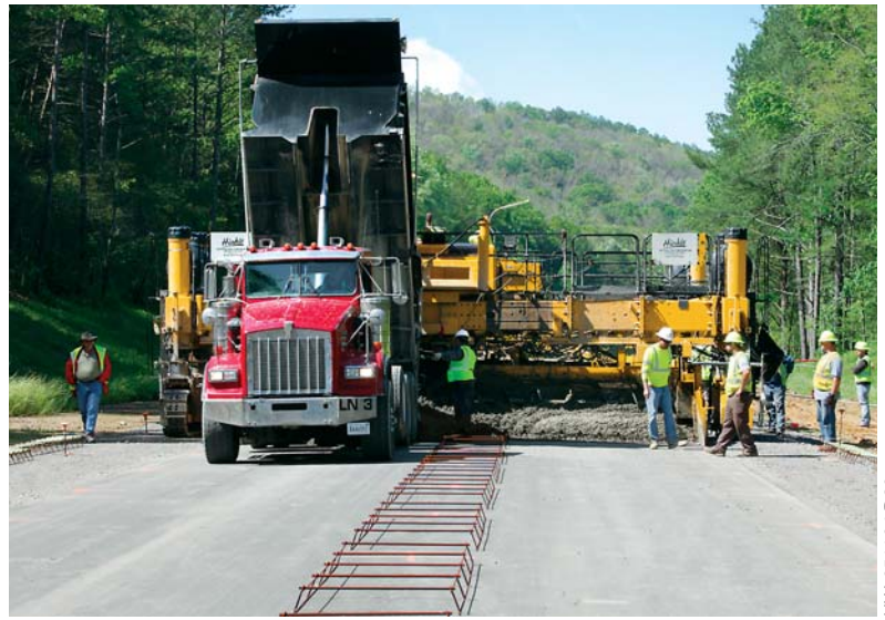
The project had no extra room for haul roads, so concrete was dumped directly on grade in front of the GOMACO PS-2600 placer/spreader. Baskets were placed by hand onto the existing asphalt grade.