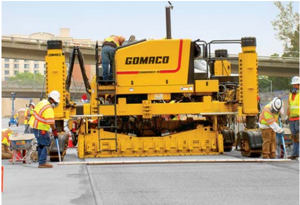
A Commander III slipforms a polymer concrete overlay on Interstate 5 in Sacramento, California, USA.