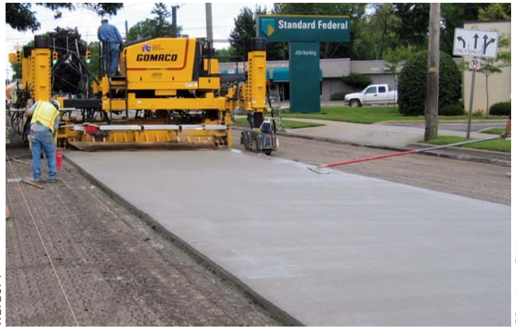
This 16 feet (4.9 m) wide, four inch (102 mm) thick whitotopping was slipformed with a Commander III over existing asphalt in Kalamazoo, Michigan, USA.