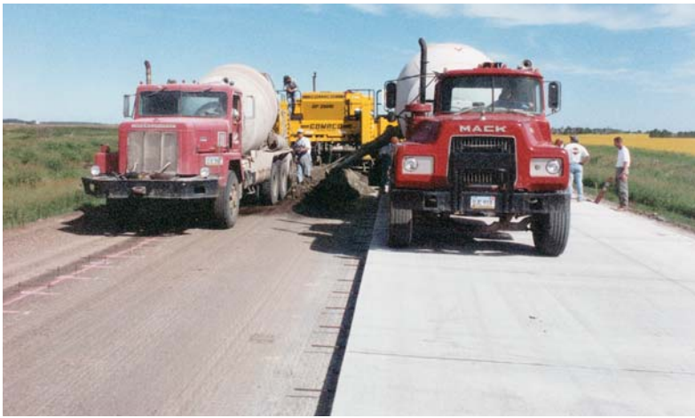
Whitotopping depths of five, six and seven inches (127, 152, and 178 mm) were slipformed with a GOMACO GP-2600 on a project near Jamestown, North Dakota, USA.