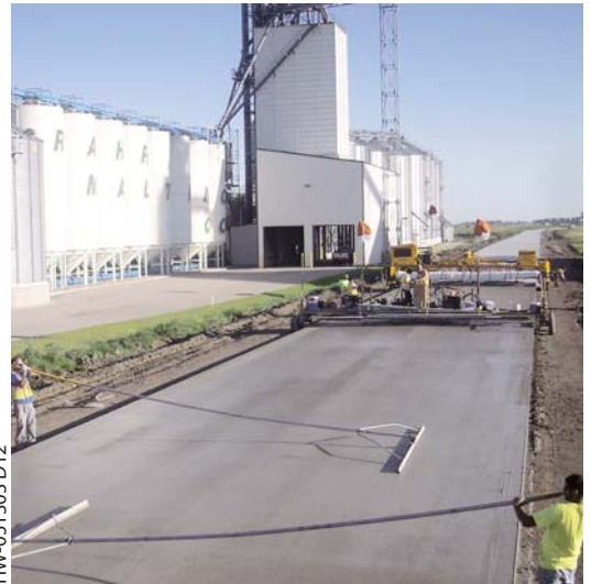
A GOMACO T/C-600 texture/cure machine worked behind the GOMACO paver.