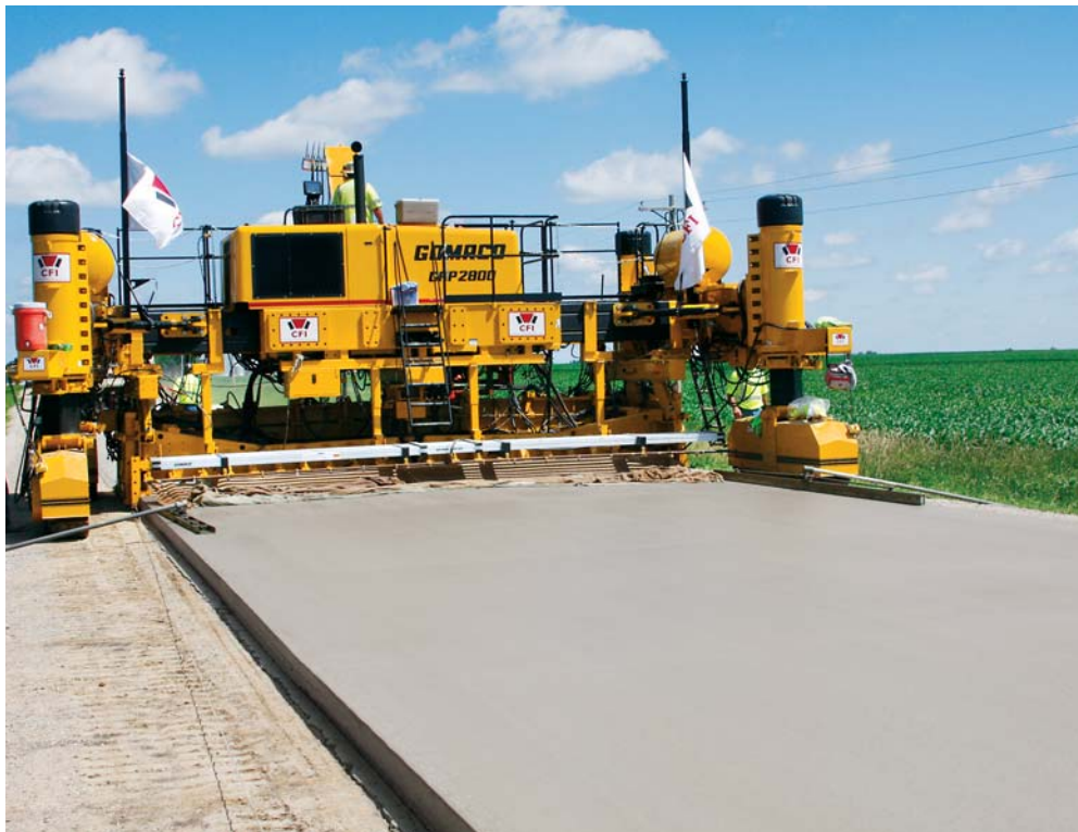
Transverse joints in the new four inch (102 mm) thick, 22 feet (6.7 m) wide overlay are every six feet (1.8 m), and longitudinal joints are every 5.5 feet (1.7 m).