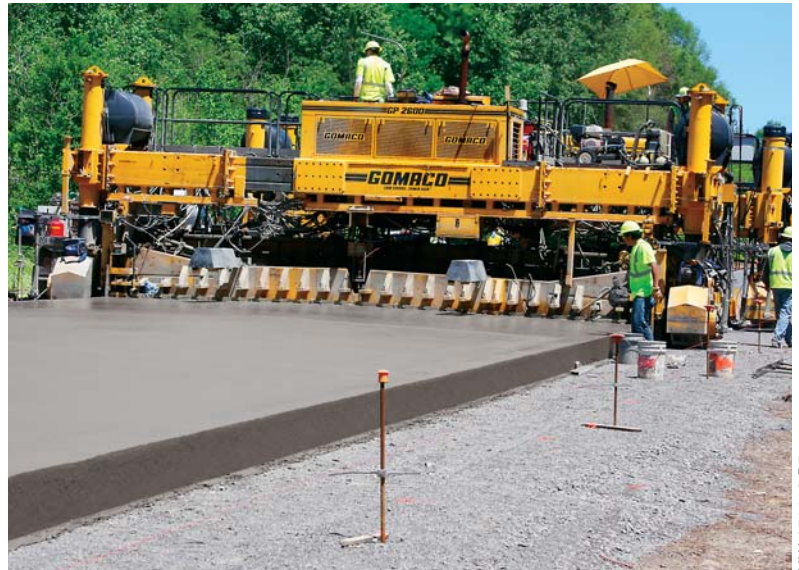
The paver-mounted GOMACO GSIs were powerful diagnostic tools as the contractor in Alabama worked to fine-tune their paving process for the challenging rideability specification.