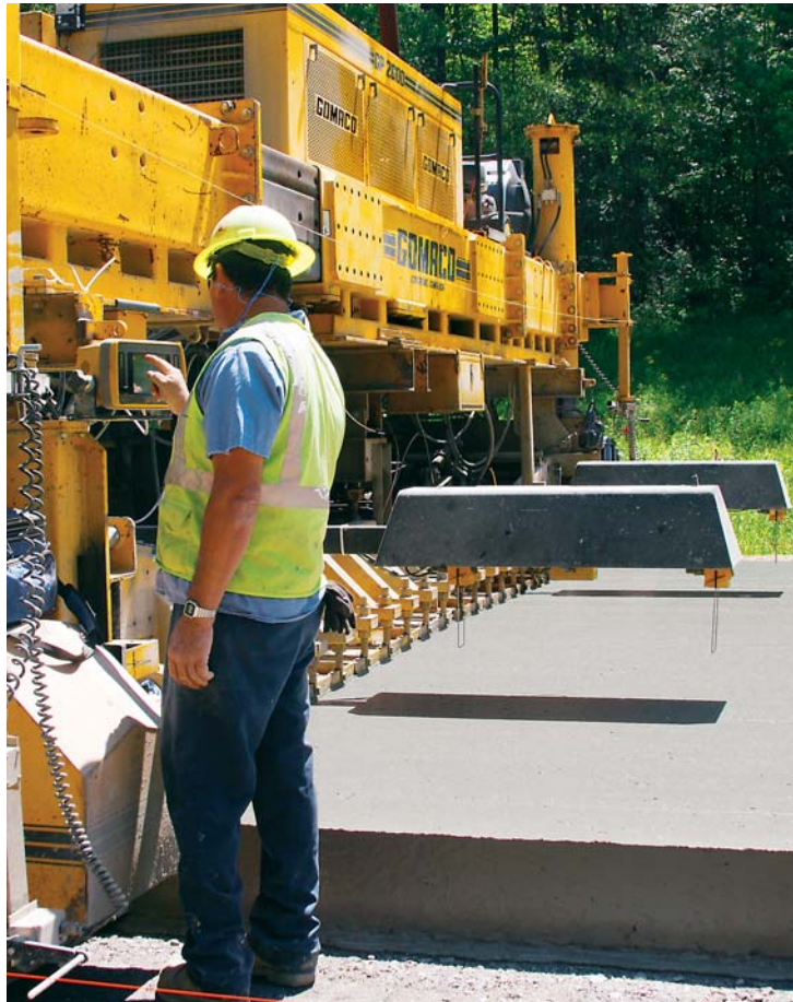
The GOMACO GSI display can be mounted at eye level on the side of the paver, and offers a variety of viewing options of the information collected by the on-board GSI units.

This was the first concrete project to be let in the state of Alabama in almost 30 years and the state's first concrete overlay. It came with some difficult specifications on the slipformed concrete's smoothness, edge and thickness. The on-board GSI units helped the contractor fine-tune their paving operation to achieve ultimate rideability.