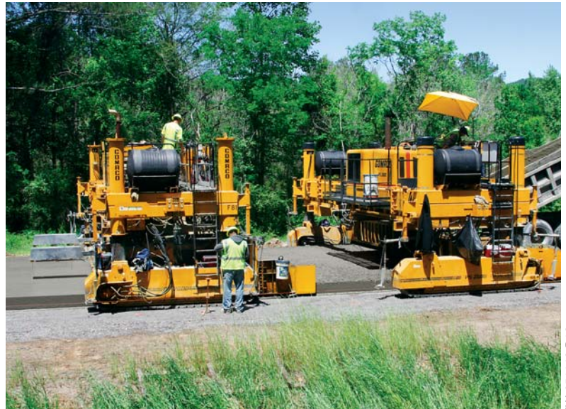
Draft of the paving mold, concrete slump, size of the concrete head in front of the paver, and other factors were studied to see what influence they potentially had on pavement smoothness.