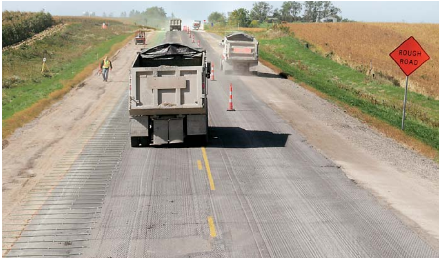
The existing asphalt surface was milled, swept, and cleaned to prepare for the unbonded concrete whitetopping. Trucks dumped the concrete directly onto the grade in front of the paver.