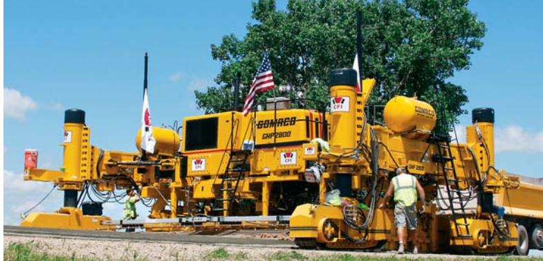
Concrete is placed directly on the existing asphalt. The surface only has to be swept clean before the concrete is dumped on top of it.