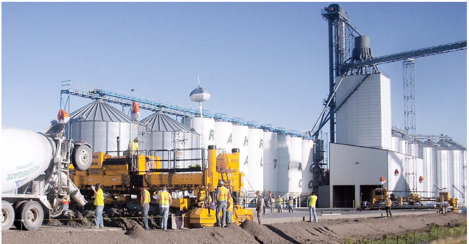
The GOMACO GSI on the back of the GP-2600 gave real-time smoothness results allowing instant fine-tuning of paver operations for smooth ride.