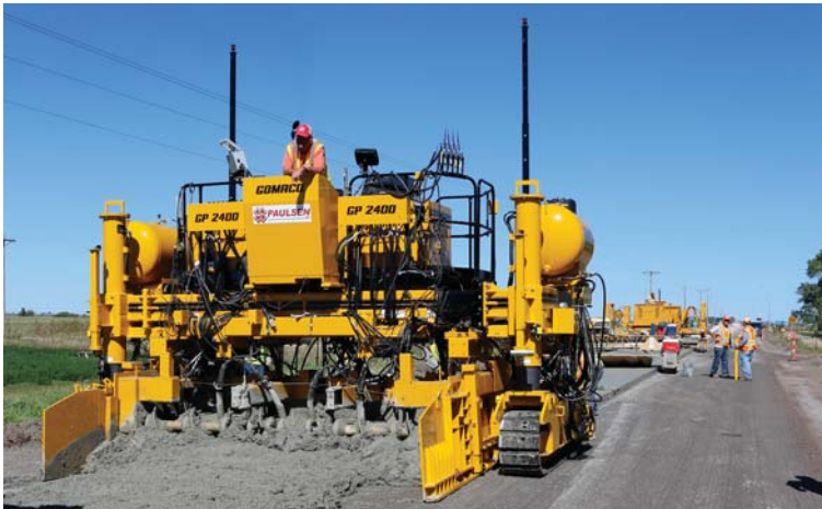
A two-pass concrete whitotopping was placed on State Highway 24A near Cozad, Nebraska, USA. The GOMACO GP-2400's single-lane paving passes were 12.5 feet (3.8 m) wide and five inches (127 mm) thick.

You can always find us at: http://www.gomaco.com