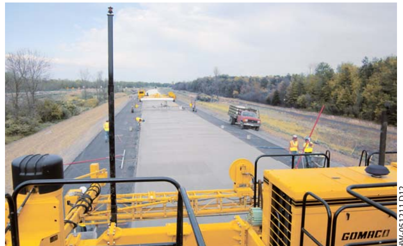
A GOMACO T/C-600 texture/cure machine followed the paver and applied a longitudinal tine and white spray cure.