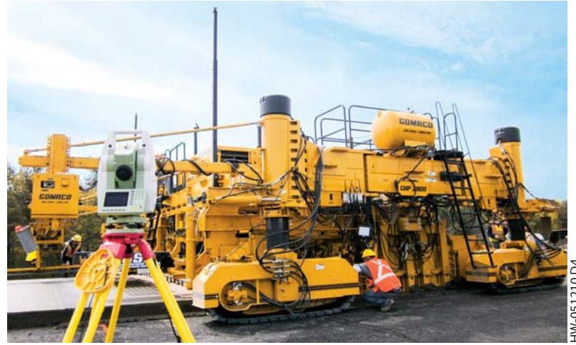
The paver is equipped with Leica Geosystems 3D, two paver-mounted GSI units, and an IDBI for placing the dowel bars for the transverse joints.

The contractor slipforming the project stated, "I've had some industry feedback stating straight out that this is the smoothest concrete pavement that anybody has ever ridden on in New York."