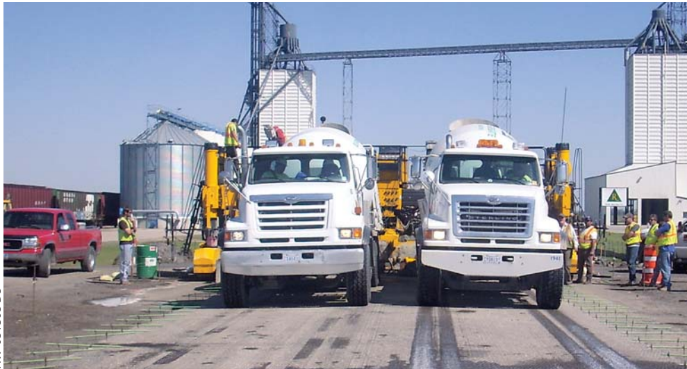
Elevated shoulder tie bars at the edge of the pavement were used to tie on a new concrete shoulder over the existing asphalt surface.

This highway was chosen for a concrete overlay due to the very high level of truck traffic generated by two large industrial facilities on the route.