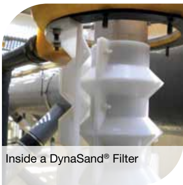
Inside a DynaSand® Filter