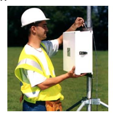
ENC 12/14 being fitted to a Campbell Scientific Tripod

PS100E-LA, BP17E-LA, BP24E-LA, BPE-ALK and PS100 E-A100 Power Supplies