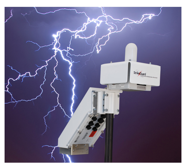
The SG000 interfaces with a datalogger, CS110, or PC using the FC100 fiber optic module and fiber optic accessories (see above).

Logan High School in Logan Utah has a lightning warning system that consists of the CS110 mounted to a 10-ft stainless-steel tripod and lights that indicate the likelihood of lightning. The tripod sits on a roof next to the football field.