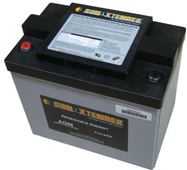
The 25962 is the 84 Ahr battery included with the BP84 and PS84. It can be purchased separately as a replacement part.

The PS84 is for situations where it is desirable to have the power supply housed in a separate enclosure. The PS84 consists of an 84 ampere hour sealed rechargeable battery, mounting bracket, two sideplates, one bridge-plate, and a 14" x 16" environmental enclosure. The battery fits vertically in the bracket leaving about 4" of head space above the battery to mount other items.