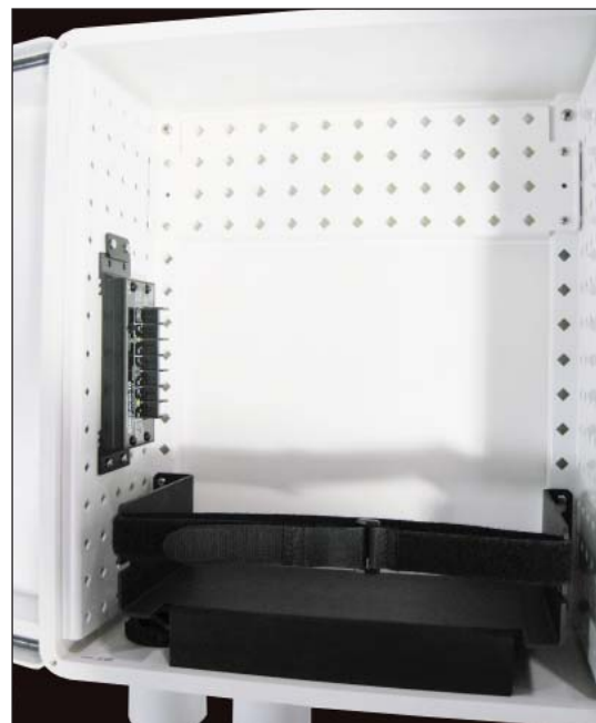
The PS84 comes with the SunSaver regulator mounted to one sideplate and the bracket mounted to both sideplates. The above PS84 has cable entry option -DC. The battery is not shown (see top photo).