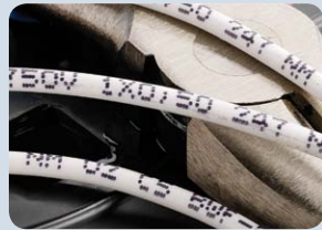
High-contrast ink jet printing on PVC, polyethylene cross-linked polyethylene, polypropylene