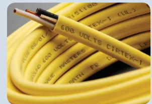
High-contrast ink jet printing on PVC, polyethylene, cross-linked polyethylene, polypropylene and more