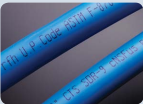
High-contrast ink jet printing on rubber, PVC and many plastics