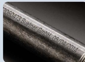
Laser and ink jet printing on metal, rubber, PVC and other plastics