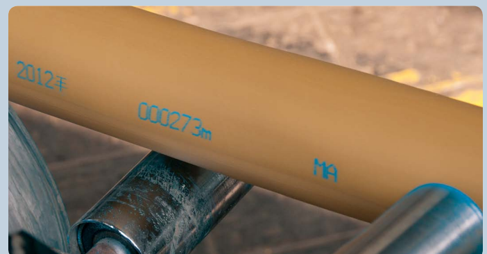
High contrast ink jet coding on large gauge cable