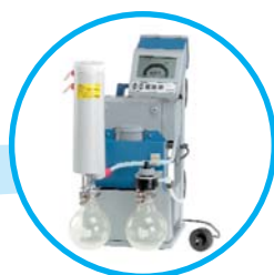
VARIO chemistry pumping unit PC 2004 VARIO