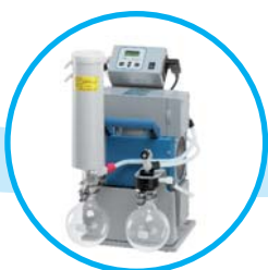
Network vacuum pumping unit PC 600 LAN