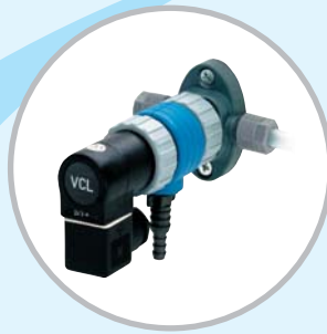
Automatic control module VCL 10 A1