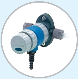
Manual flow control module VCL 01 A1