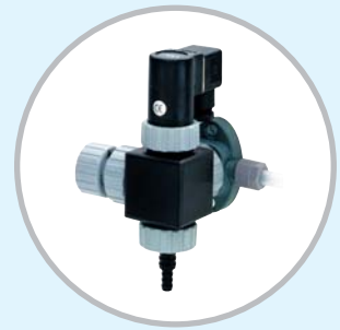
Manual flow control/ automatic control module VCL 11 A1