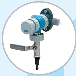
Shut off/ manual flow control module VCL 02 A1