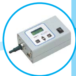
Vacuum network controller VNC 1

VACUU·LAN® - VCL modules are the connecting parts of the vacuum network. They are completely assembled i. e. pre-assembled and ready for installation into new planned lab furniture (A2, A3, A5) or for retrofitting