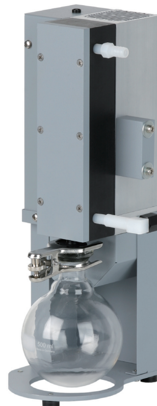
Peltronic Exhaust Vapour Condenser

Peltronic Exhaust Vapour Condenser: Pays for itself within 1 to 2 years!