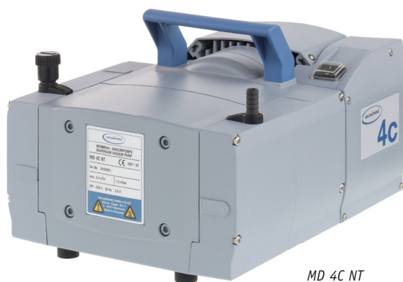
MD 4C NT down to 1.5 mbar